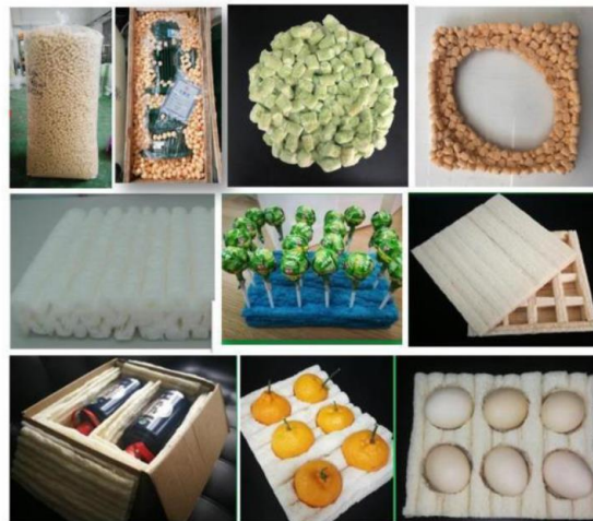
Figure 1 The examples of starch-based materials that has been replacing the conventional plastic packaging.

Figure 1 shows that more companies in their respective countries has taken this initiative which is using the commercialized starch items. By adopting restrictions and falls by prohibiting waste plastics, more starch-based packaging is being produce. Past experiments have shown that starch is a heterogeneous substance with two compounds kinds of microstructures: linear and branched. Natural physical starch mostly has bulky semi-crystalline. Jiang mentioned that the tools decide the crystallinity and it is about 20-45 per cent. The recuperation of the crystalline lead by the short-branched chains in amylopectin of the crystalline and exist in the shape of double helices with a duration of ~5 nm. Throughout the crystalline regions the amylopectin fragments are mostly similar to the broad helix axis ( Jiang et al. ).