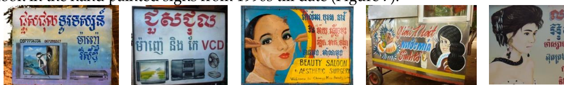
Figure 7 Commercial local shop signs from Phnom Penh, Cambodia (from 1950s – till 2000s)

The available records, as part of published literature of shop signs from Cambodia in particular have been archived in form of published literature celebrating the eternal beauty of hand-painted text, forms and colors in commercial context of business and promotional design. Most of the colorful shop signs, that represent everyday goods and services have been painted on sheets of metal by artists in tiny makeshift studios ( Duzaryan ). This paper studies signs from the city of Phnom Penh in Cambodia under following genres and chronologies: 1) Classical times: signboards from 1930s till 1950s, 2) Cambodian nationalism times: signs belonging to the dark 1970s, 3) Cinema and romance: Cambodian female actors signs in 1980s, 4) Fashion savvy times: Phnom Penh look in the hand painted signs from 1990s till date (Figure 7).