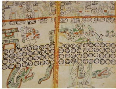
Figure 13 Pages from Maya Madrix codex of picture-words. Book Source: Signs, Symbols and Ciphers by George Jean (1989)

In addition to above, a detailed collection of shop signs from other time periods have been part of the doctoral research; as follows: 4) Town life of Medieval Europe: signs from mid-16th century till 20th century, 5) Shop signs in the Digital age, late 20th century and onwards. In a nutshell, historical records of signs from pre-historic times in Europe to digital age is mutually homogenous than collectively exhaustive and country-specific separate journeys of signs and shop signs in the Asian land. Influences in these countries too have been from pre-historic cave art and other abstract and symbolic pictorial forms present on rocks, art and sculpture, writing etc. But, more prominently, we see a dominance of the symbolism having a parallel union with material craft such as the signs as guilds, labels, solid hanging fascia etc. We can summarize them as popular forms of signification, for instance, in France and Spain indicate more popular signs in the caves; Rome and Greece envisage popularity of signs in context of religious themes explored by artists and sculptors. While, the other side of London signs are more synonymous with the typical Victorian mood often associated with their unique guild signs, trade signs and ancient shop fronts.