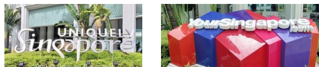
Figure 6 Uniquely Singapore (sign) in 2009 to Your Singapore.com (by STB around 2010).

Unique is the word that best captures Singapore. The dynamism in colors and richness in sign designs are a harmonious blend of the culture, arts and architecture of the island country. However, Singapore Tourism Board (STB) changed the slogan from 'Unique Singapore' to 'Your Singapore' in 2010 in order to enhance the feeling of belongingness with the dynamic city (Figure 6).