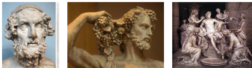
Figure 12 Homer: author of the Iliad and the Odyssey, and Aeolus: in Greek Mythology [left, middle]; Aeolus, ruler of the winds (right)