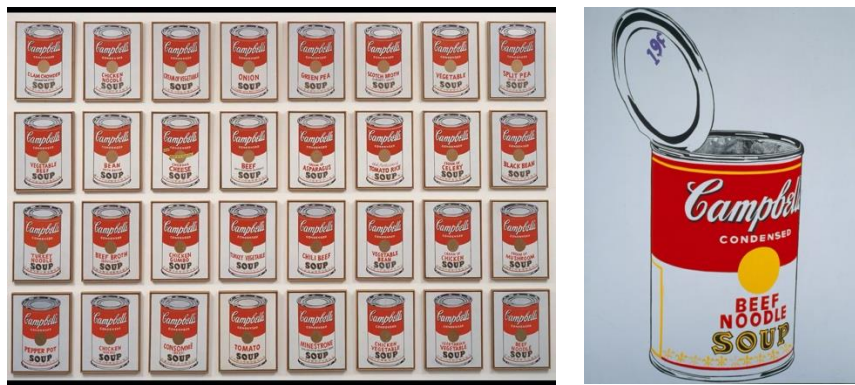
Figure 14 'Campbell soup cans' life-size paintings by Andy Warhol.