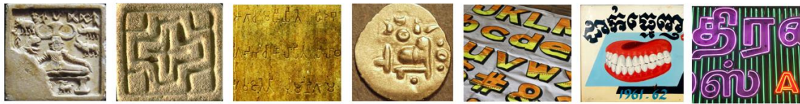
Figure 3 Images from the HandpaintedType.com (2011) by Hanif Kureshi and team, New Delhi

In addition, there's a historical narrative to understand the evolution of signs as pictorial symbolic depictions to handsome shop fronts/exterior adorned with signboards (Figure 3), from different time periods; representing different shades of traditions, cultures, movements, genres and styles in signs and signboards of India as follows: 1) Vedic times: The Harappan civilization, 2600 BCE to 1900 BCE, 2) Epic times: Hindu kingdoms on the Ganges, 1400 BCE to 1000 BCE, 3) Rationalistic times: Hindu expansion over all India, 1000 BCE to 320 BCE, 4) Buddhist times: ascendancy of Magadha, signs from 320 BCE to 400 CE, 5) Pre-industrialization times: 15th century to early 19th century, 6) Modern times: 20th century and onwards.