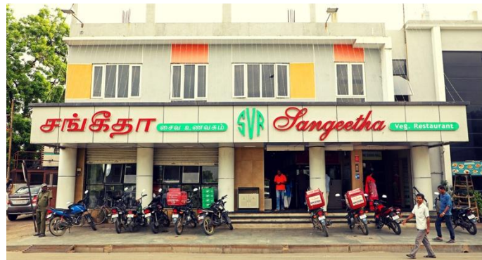
Figure 1 Sangeetha Restaurant, Chennai, India.