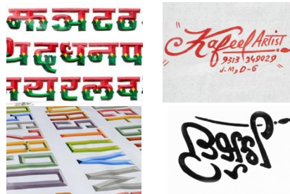
Figure 2 Images from the HandpaintedType.com (2011) by Hanif Kureshi and team, New Delhi

Signs in India, since antiquity, go back to the earliest forms of significations in the Indus valley civilization, 2600-1900 B.C. The rich Indian symbols and forms of beliefs and rituals have gradually developed to the fundamental pre-Vedic folk myths and legends influencing the daily fabric of life in past as well as the present (Damodaran). Since early 19th century till present times in India, age-old technologies co-exist with the high-tech world, bullock carts sharing the roads with fords and shanties being as much part of the cityscape as are the numerous skyscrapers. As a result, a very distinct visual language of signboards has emerged giving streetscapes in India a unique identity. In the context of India, actually both traditional and modern shop signs seem to function more as visual communication exemplars of the vast and rich crafts or some other ephemeral forms of visual culture pervading different marketplaces as a collective unit display of material culture. Illustrated are specimens of hand-painted craftsmanship of two sign-painters who paint boards, hoardings and truck graphics in old Delhi from a project that is dedicated to preserve the typographic practice of street painters in India (Figure 2).