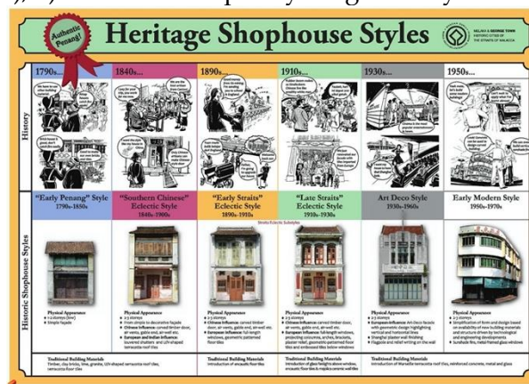
Figure 5 Heritage shop house styles, George Town, Malaysia.

Chinese and Indians among the locals (De Ledesma et al.). The entry of later Islamic art into the Malaysian visual culture made floral designs and related patterns very popular in those times. Post the 1950s when Malaysia became an independent nation, Malaysian contemporary artists tried to develop their own art and began to avoid the controlling influence of western art that existed during the ancient colonial times. For instance, among the visual artifacts on display in this country have been the Malay manuscripts and writings together with Malay cultural material such as keris, a traditionally crafted Malay weapon (Ayob). The journey of Malaysian signs can be traversed through three periods as follows: 1) Early Development in Signs: 7th-14th century, 2) Malay Vernacular style signs: 14th-18th century includes an interesting case study of ancient shop house designs in a culturally rich and commercially now affluent trade centre of Georgetown in Malaysia (Figure 5), 3) Chinese Baroque style signs: early 19th till late 20th century.