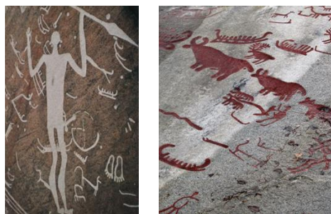
Figure 9 a. Masculine figure rock engraving at Tanum, Sweden (1400 B.C.). George Jean (1989), b. Rock painted grazing animal carvings at Tanum, Sweden.