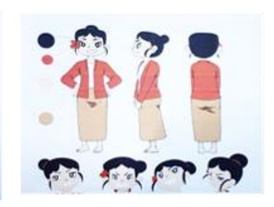
Fig 1. The illustration of the three main characters in Bawang Merah Bawang Putih

Immediately from the fig. 1 we see some similarities in the color used to illustrate the character. The color brown is very prominent in all the three characters. The brown color was applied in all of the clothing for the characters. Wijayatno and Sudrajat wrote that the color of brown is one of the colors that can symbolize ones religiosity in the ancient Javanese culture (Wijayatno and Sudrajat). The application of brown color into the outfits brings an aspect of tradition and immediately evokes a sense of morality in relation to the overall plot of the story. In figure 1(a), Bawang Putih who was depicted as an innocent girl in the story was visualized in the white clothing.